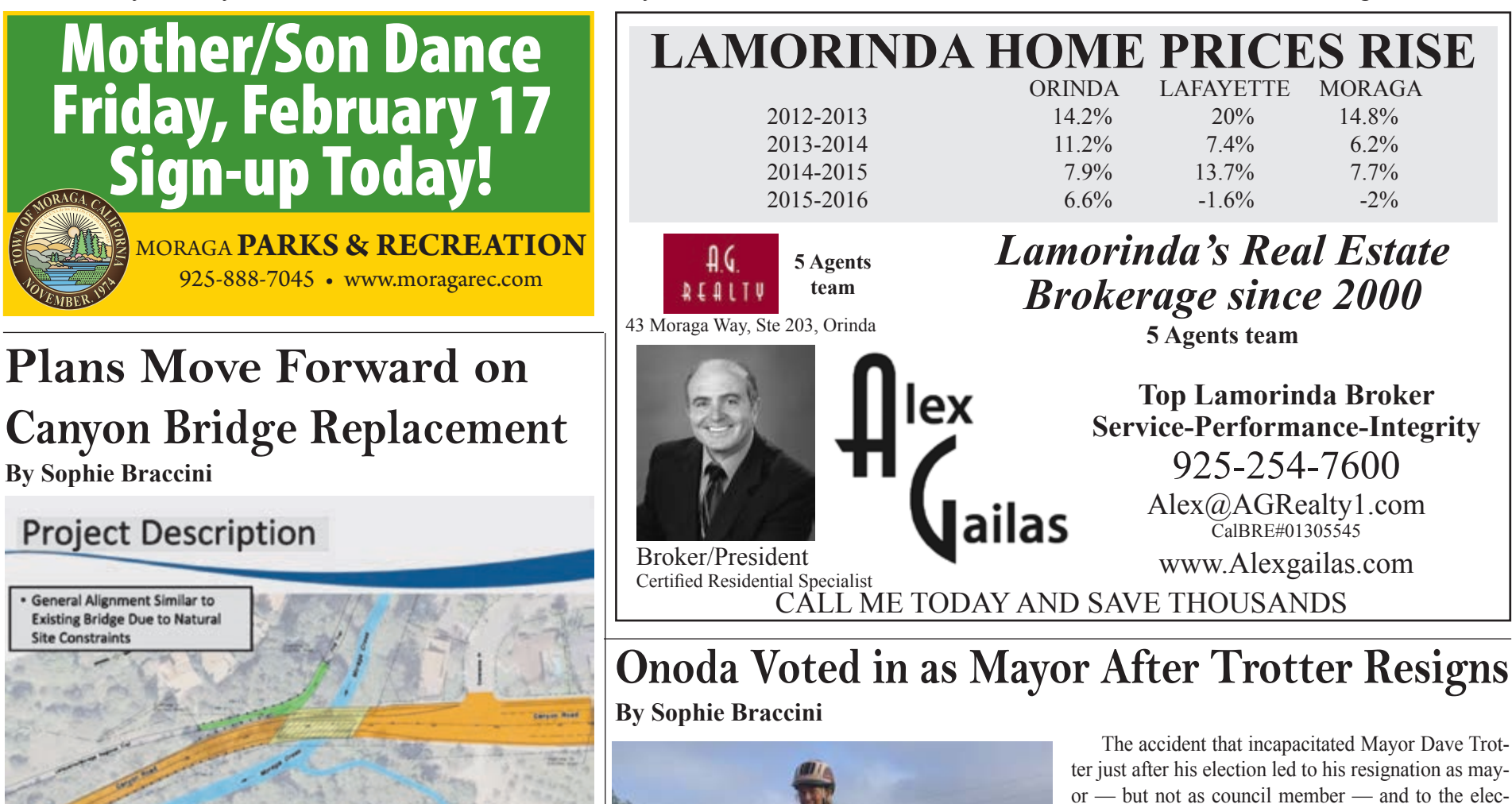
The proposed new Canyon Bridge.

unincorporated Canyon area. The cient by the California Department 1936 piece of infrastructure that of Transportation and eligible for recrosses the large Moraga Creek (the placement. ... continued on page A9